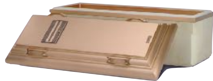
The Wilbert Bronze $13,000 Ultimate triple-reinforced protection Cover and base reinforced with durable bronze alloy Exterior base completely encased and reinforced with high impact plastic Memorialization Plus capsule (brass) and custom nameplate