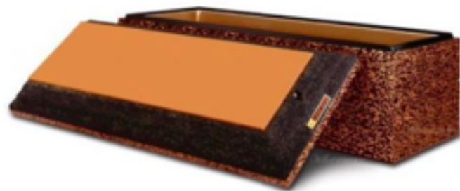
Copper Triune $3700 Double-reinforced burial vault Rich copper beauty High-strength concrete with copper and high-impact plastic Special emblems and customized nameplate