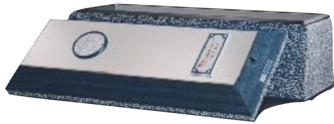
Veteran Triune $2900 Extra heavy concrete construction Stainless steel interior metal liner Tongue-in-groove seal Branch-specific military emblem U.S flag customized nameplate