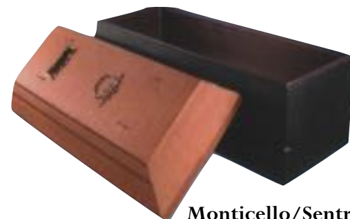
Monticello/Sentry Lined and Sealed Burial Vault $1500 High strength concrete construction Strentex inner liner Tongue-in-groove seal