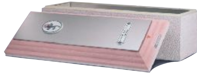
Cameo Rose Triune $2900 Extra heavy concrete construction Stainless steel interior metal liner Tongue-in-groove seal Sculpted pink rose and customized nameplate